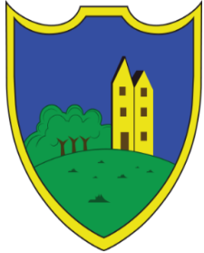
Bruton Primary School